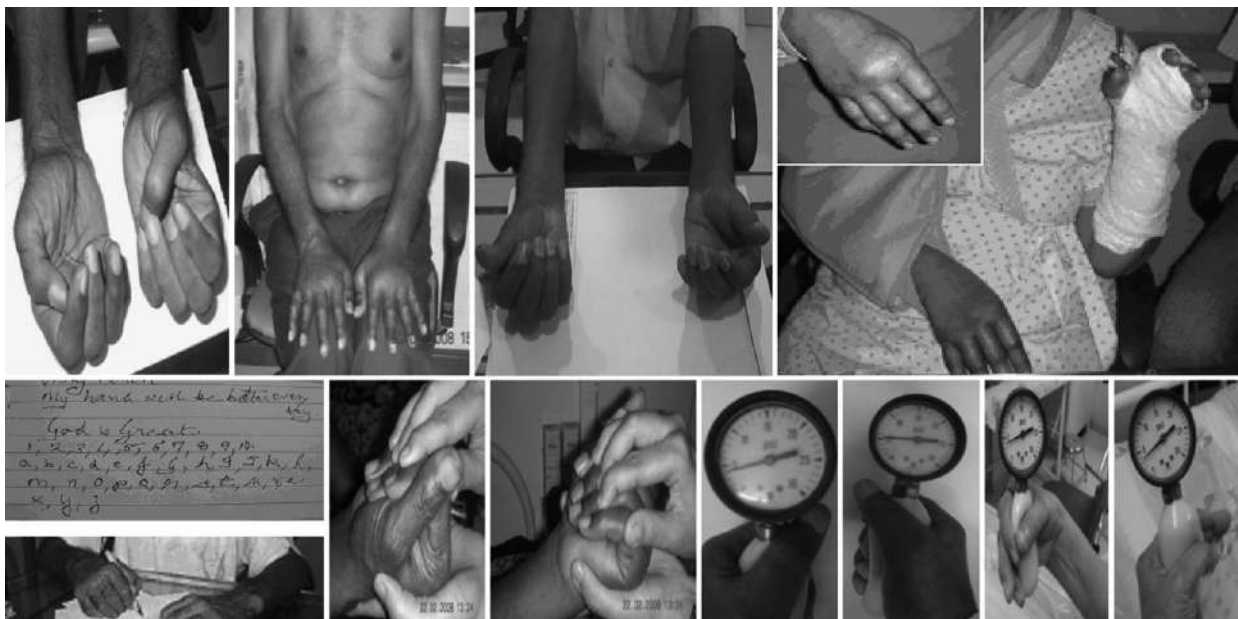
Figure 1 (First row, left to right—figure of Patient 3 not included so as to maintain clarity of other figures.) Patient 1 : 52-year-old man with bilateral claw hand. He had severe stiffness from fixed deformity that made writing, holding cups, cutlery, etc. impossible for 14 months after complex regional pain syndrome-1 (CRPS-1). Flexor and extensor muscle contractures were palpable as ropy strands and attempts to make a fist passively resulted in pressure allodynia. Note also the scars of sword injury that severed several tendons in both palms and forearms. He presented with 5–8 verbal rating scale (VRS) pain only on movement. Edema and hair growth (R > L). Patient 2 : 72-year-old diabetic man had severe pain, sensory and motor features of CRPS-1 in both hands 4 months after a fall that resulted in soft tissue injuries; left more affected than right; complete disability, unable to get out of bed, and dress or feed himself; complete prostration. The man had severe rest pain (VRS 8–10) with hyperalgesia, allodynia, severe stiffness, weakness, dystonia, and abnormal movements (L > R). Patient 4 : 60-year-old lady had plating done for right elbow fracture and external fixator put for left lower end radius fracture 5 months prior to presentation. The woman had severe rest pain (VRS 8–10), hyperesthesia, hyperalgesia, and allodynia, severe stiffness, and weakness. She had swelling, warmth, and color changes (R > L); confusion; disturbed sleep, complete disability, unable to get out of bed, dress or feed herself; and complete prostration. Patient 5 : 51-year-old man presented with CRPS 8 months after multiple intramuscular trigger injections for pain and multiple intravenous injections on both upper limbs. He had severe pain on movement (VRS 8–10) and moderate rest pain (VRS 5–7); severe stiffness and weakness, swelling, cold to touch and color changes, point allodynia, muscle wasting; depressed, disturbed sleep, severe disability of volitional movements (L > R). Bottom row : The same patients at various stages of motor recovery. Patient 1 is writing at 5 weeks; patient 2 is making a complete fist 1 week after MMTR with some passive pressure from the physiotherapist. Patients could close their fingers over the dynamometer bulb by 1–2 weeks, although still unable to compress it. By 2–4 weeks (3 weeks in the less affected hand and 4 weeks in the better hand), their grip strength could generate 3–4 pounds per square inch of pressure. This figure shows patients 4 and 5 at 5 weeks.

effective. ROMs measured before and after DN showed a predictable and consistently reproducible increase.